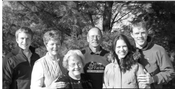
Three Generations of Currey Family

To see a video of their operation, visit http://www.mynorth.com/My-North/Video/?vid=3247