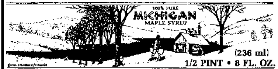
Scene on Sugarhill jug