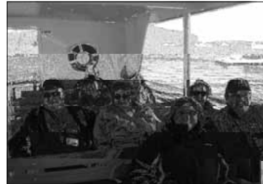
Our Michigan group enjoying a cruise of Bar Harbor and a fine sugar house Meal.