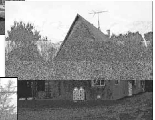
A representative northwest Maine sugar camps